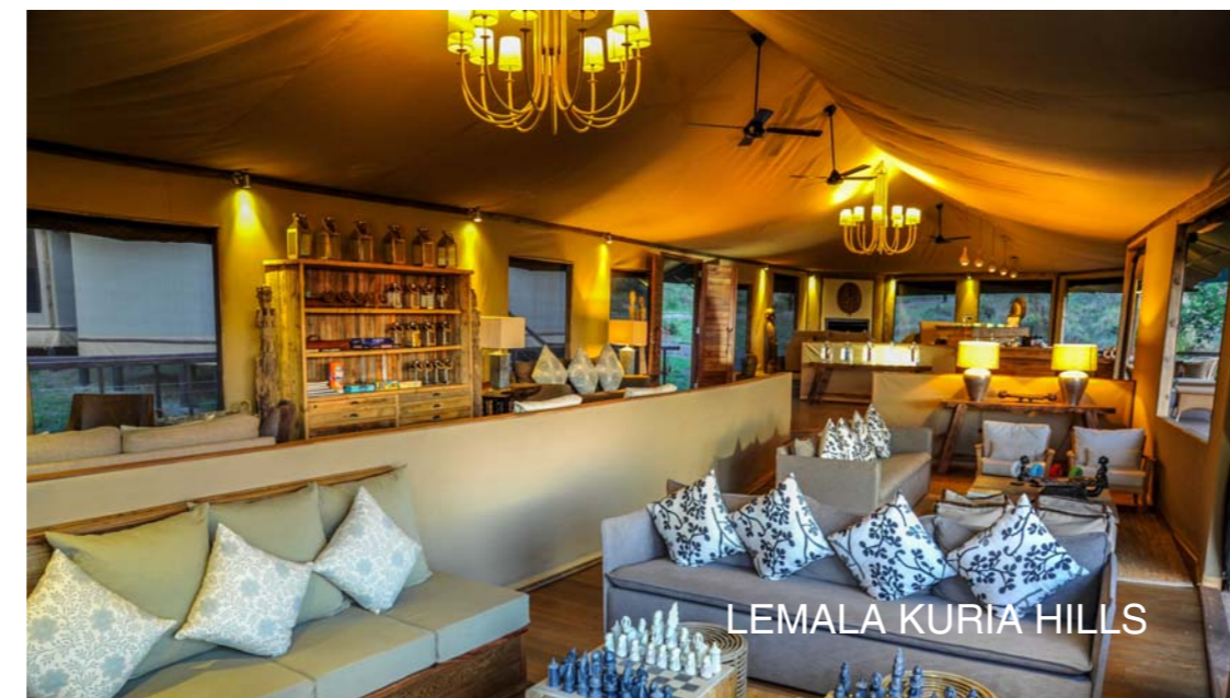
LEMALA KURIA HILLS