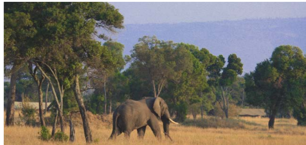
Mara Mobile Tented Camp